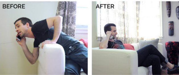
Sitting on the couch while your phone is charging? The Couchlet nests between cushions.