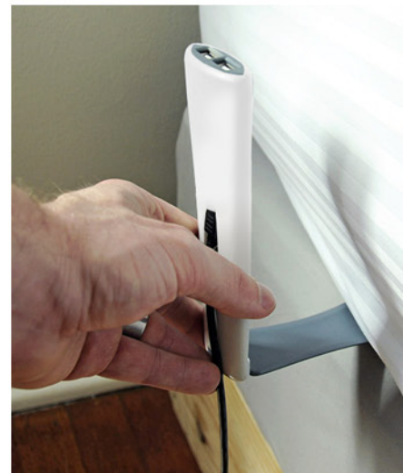
Slide the Couchlet under the mattress or between the mattress and boxspring using the folding elbow. It can also be wedged under horizontally in the folded position.

Wedge the Couchlet between couch cushions or next to the armrest. Use the folding elbow if you need extra stability, but most cushions hold the Couchlet nice and tight.