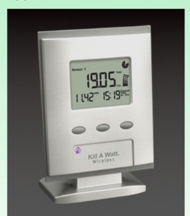
Requires P4200 Kill A Watt® Wireless Display (sold separately)

Using multiple sensors lets you conveniently measure and monitor from a central location. No need to plug and unplug your appliances. The Kill A Watt Wireless display will show you the