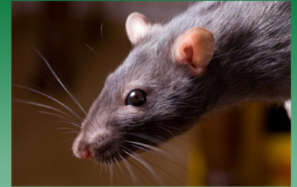
Rats and mice