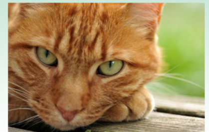
Cats and Sables/Martens

Keep pesky animals from making themselves at home under the hood of your car. Squirrels, rabbits, rats, martens/sables, and even cats commonly crawl inside engine compartments due to the enticing heat. In the meantime they can damage cables, wiring harnesses and other expensive parts.